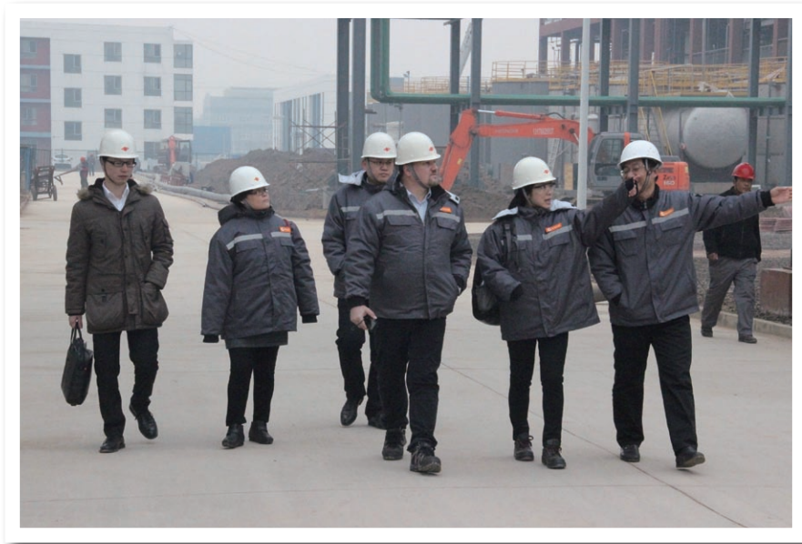
Figure 2. Investors are being briefed on the production facilities at Tsaker Chemical 圖二. 彩客化學為投資者參觀及介紹生產基地

For external stakeholders, the Group has held stakeholder meetings and invited investors for site visits on its production plants. Starting from 2017, the Group will further strengthen its communication with different stakeholders. The Group encourages stakeholders to provide suggestions and express their views through various communication channels to improve its business operation.