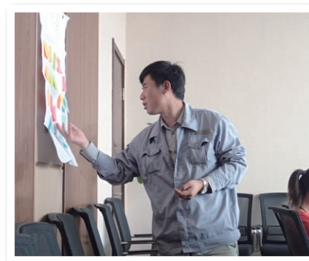
Department head's representative presented their consenses on materially issues 部門主管為大家總括重要性議題

Results and feedbacks from the ESG workshop and stakeholder surveys served the purpose of identifying the material aspects in relation to environmental, social and governance that affect the Group. A majority of the employees agreed that the aspects related to product responsibility and intellectual property rights were of particular importance to the Group's business operation. This indicated that employees attach great importance to the Group's exclusive intellectual property rights with regard to its product manufacturing and development.