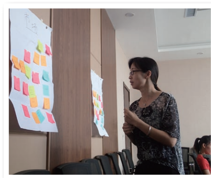
Department head's representative presented their consenses on materially issues 部門主管為大家總括重要性議題