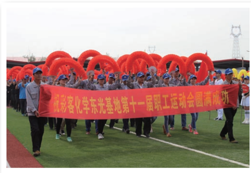
Figure 3. The Group has provided various activities for employees to enable them to achieve work-life balance 圖三. 本集團提供不同的活動供員工參與，讓員工找到工作與生活的平衡

在報告期間，本集團符合所有有關薪酬及解僱、招聘及晉升、工作時數、假期、平等機會、多元化、反歧視以及其他待遇及福利的相關法律法規要求。