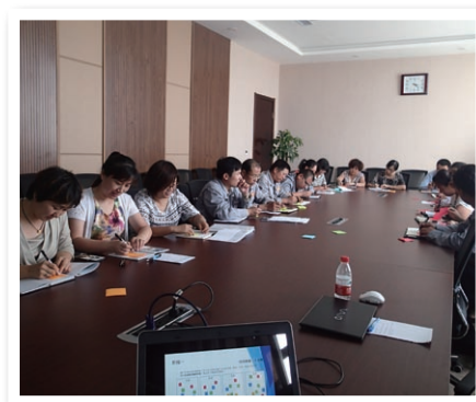
The Group's department heads actively involved in the stakeholder engagement exercise 本集團部門主管積極參與持份者活動