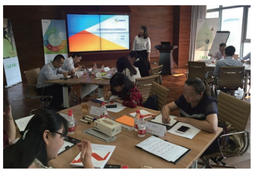
Figure 4. The Group held various training programs from time to time to enhance the quality of the employees 圖四. 本集團不定時舉辦各項培訓項目，提升員工素質

隨着業務不斷擴展，本集團賦予員工發揮潛能的機會，增強其於行業的綜合競爭力。本集團對員工的培訓遵照系統性、制度化、多樣化和效益性原則，以提高員工的知識水平及專業技能。於報告期內，本集團分別為員工設立自我培訓和內部培訓，共舉辦了超過20多個內部培訓項目和計劃讓員工自由參與，為求提升員工素質，並加強員工的歸屬感。